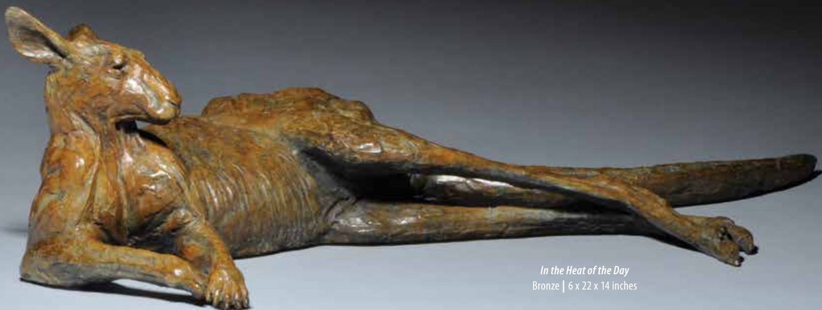
In the Heat of the Day Bronze | 6 x 22 x 14 inches