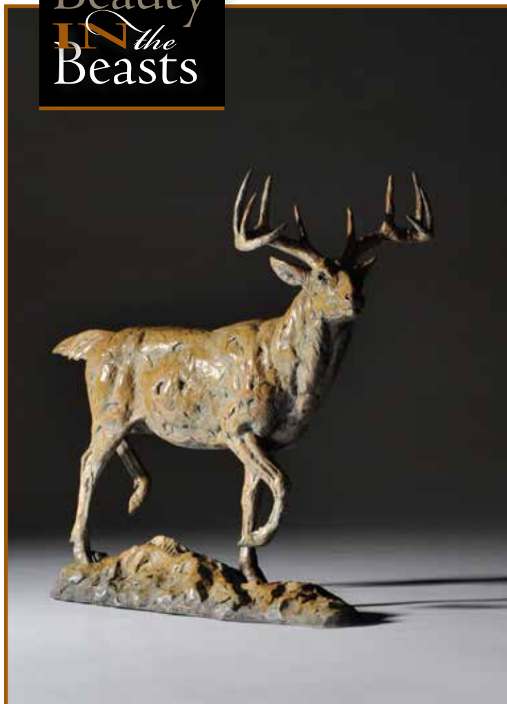
In the Fall Bronze | 20 x 22 x 8 inches

texture and how you handle lines is a critical thing in sculpting,” says Doellinger. “Although my work is representational, it has a loose texture. Anatomically, the proportions are there, but I’m not worried about anything exactly. It’s more a combination of anatomy, composition and texture.”