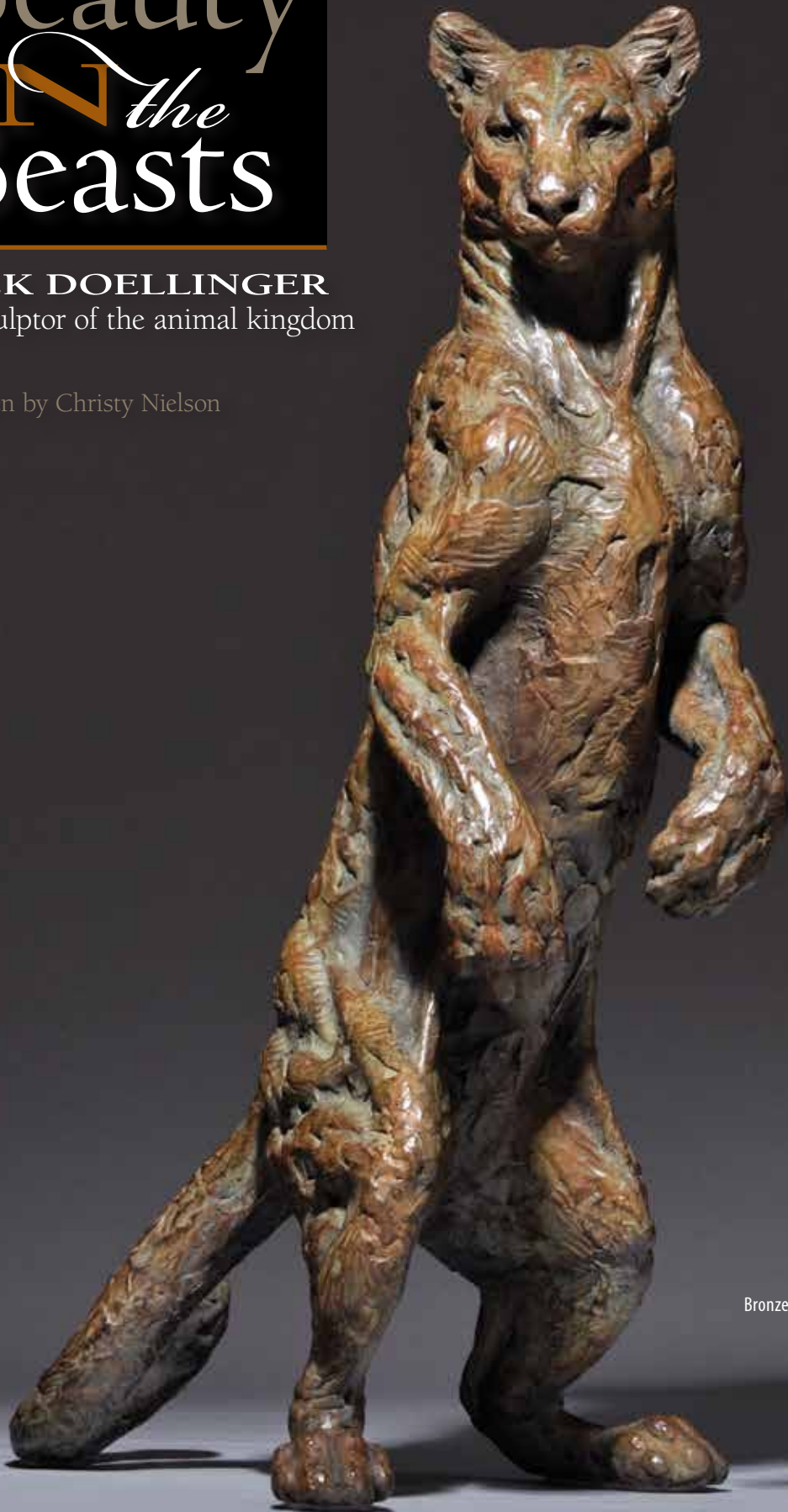
Curiosity Bronze | 37 x 24 x 15 inches